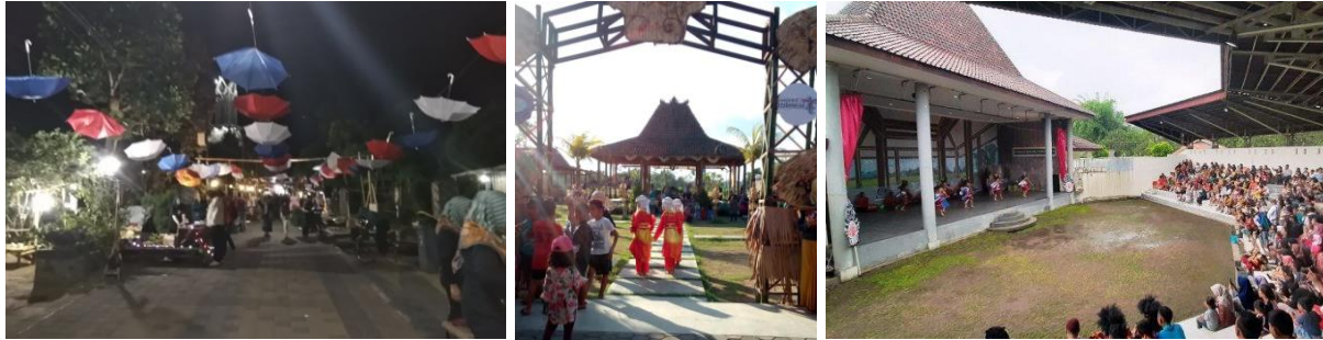
Figure 2. Wanurejo Cultural Arts Event activities

development, has been working with local groups that can support tourism, such as Gapoktan , Pokdarwis, Art Groups, and Batik Craft Groups. The cooperation is in the form of preparing accommodation and tourist activity locations in Balkondes, Andong (traditional horse cart) tour packages, onthel (traditional bicycle) tours, VW cruises, and cultural tourism events.