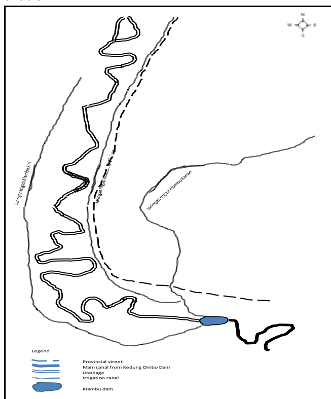
Figure 2. Research Site

This research focuses on diffusion of lelang management that being practiced by some WUA (Perkumpulan Petani Pemakai Air) that spreading out in Klambu Wilalung irrigation area, one of branch of Klambu dam (detail see picture 1). The area covers 20 villages within two subdistricts. The data collected by cencus to 34 P3A through observation and structured questionare. The objective 1 and 2 were analyzed by descriptive analysis, while objective 3 was analyzed by Pearson Corellation.