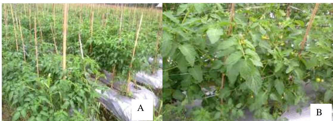
Figure 4. Tomatoes were sprayed 3x became more resistant to Fusarium wilt disease, thrips and leaf-eaters ( Spodoptera litura ), and B. Better growth and more dense fruits.

For tomato plants field, the soil was infested with Fusarium wilt disease. After the soil and plants were sprayed with biopesticides, the plants became resistant to infection. The growth was much better, flowers (Fig. 4) and fruits more dense, because this biopesticide also act as biofertilizer.