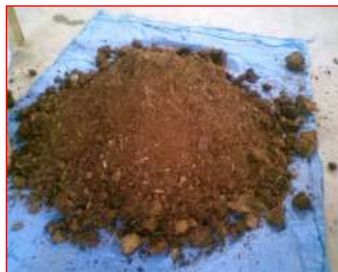
Figure 1. The small rice straw pieces was added with \frac{1}{2} x v/v water and one cup EM4, mixed together then composted for about 1 to 1,5 month. The mature compost indicated by a brown-black color, fine particle grains, crumbs (Wahyuni et al, 2013, Wahyuni and Hoesain, 2016a).