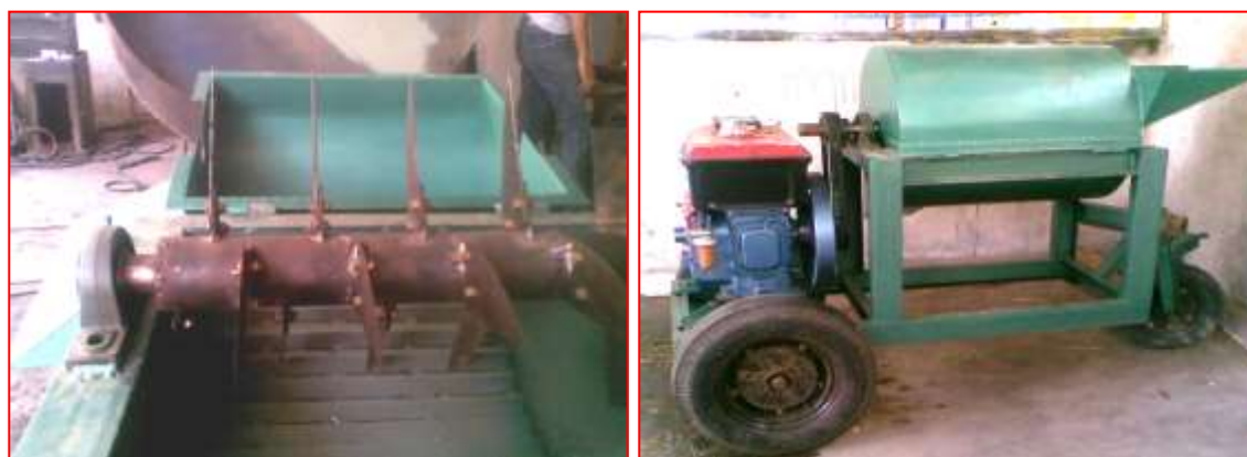
Rice straw was cut into small pieces

Rice straw was cut into small pieces, added with \frac{1}{2} v/v water and one cup EM4, mixed then composted to one -one and half months. The mature compost was indicated with a brown-black color, fine particle grains, crumbs (Fig.1). This compost was extracted with \frac{2}{3} v/v water, stirred until well mixed, then extracted with centrifuge at 1000-2000 rpm for one-two minutes to separate the coarse part with the smooth one. The extract was strained again with a fine strainer in order to get smoother particles, so it would not clog the sprayer nozzle(Fig. 2A, B). The strained water compost was put into the mixer tank after added with Pseudomonas putida H10. The mixer was rotated for 30-60 minutes /day, for about one week, and it was ready to use as biopesticide (Fig. 2 C).