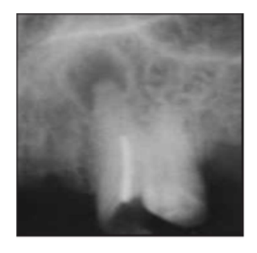
Figure 4. Tuberculoma radiograph[12]