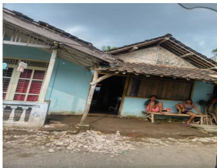
Figure 3. Dakocan with her coffee stall in the daylight periode before open stall

When the researchers conducted interviews with them, related how their attitude towards this work all replied that the activities they occur because of economic necessity, besides their stance as long as they do not disturb other people is not a problem. So, researchers looked at their individual characteristics terbenut for their economic needs and the characters are formed because they are not breaking any rules. While the rules actually do not have a written can also be mutually agreed norms. Essentially, Bandura believes that an individual's behavior influences and is influenced by both the social world and personal characteristics [Bandura, Social learning theory ].