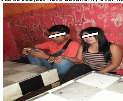
Figure 2. Dakocan when serving customers

This study, researchers have found three main informants who daily “Dakocan” addition to selling coffee at the coffee stall Ilustrasion informant to researchers explain the judgments informant age 18, 22 and 23 years. Working as dakocan average of 2 years running. Working as dakocan average of 2 years running. Working on average from afternoon until late at night between the hours of 03.00 – 12.00 pm. They were from the surrounding villages but there are also stalls from Lumajang District. Their work clothes average open casual wear tight, and air short and long leggings. Consequently, there is interference in the private sphere of individuals, namely body. The woman's body was formed, polished, and controlled to be presented consumers with men in a way that perfectly suit their imagination. The woman's body used as a locus for the occurrence contestation of power. In the contestation, woman as object hegemony and control of the patriarchal ideology and capitalism. However, not means that women can not exert themselves as subject have autonomy over herself.