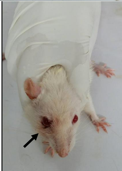
Figure 1. The clinical of TMJ OA of rat