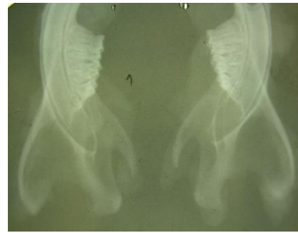
Figure 3. Control group