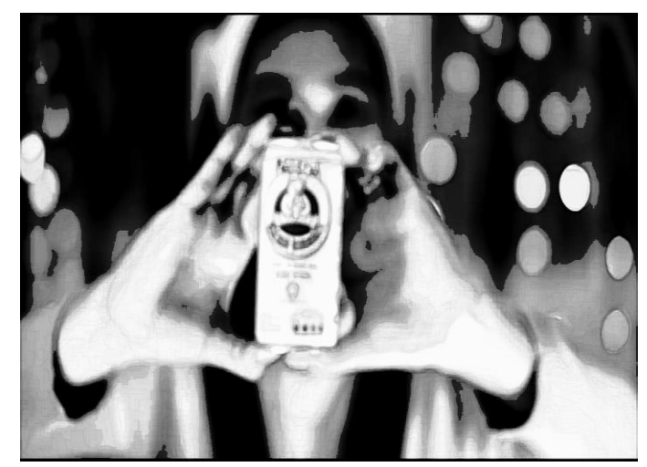
Fig 2. Touch

Touch to show a product I no longer a mental process. It is more like a material process. This type of touch is done by an actor and the target is the goal (Halliday and Matthiessen, 2004). The goal this woman targeted is the canned milk. This becomes the prominent thing as she seems to put aside everything surrounds, including her face, when introducing the product.