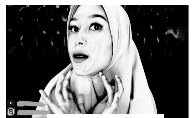
Fig 4. Challenging Look

Fig 5 and 6 indicate two meanings. First, the touch still shows how tender her skin is. She must carefully touch it, to give a proper treatment for her skin. From figures 4-6, they share something in common, that is a tender touch is that typical touch, the touch of a tip of a finger which then carefully touches the skin surface. The difference is on the eyes, fig 4 shows closing eyes, while fig 5-6 shows challenging eyes, implying those of energy and courage. The way she looks at the camera supports her touch in a way that showing her viewers on the skin after treatment. The skin will be look like this, the feel will be look like this.