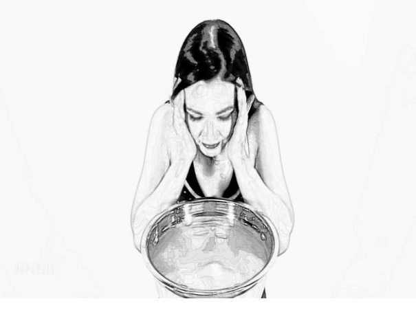
Fig 6. Touch and Face Work

Fig 6 shows another kind of work of touch and face. Her face tilts down, while her hands rub her sides of her face. This is meant to ask for viewers to see and follow what she is exactly doing. Both touch and face work together.