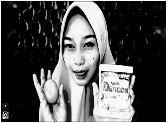
Fig 1. Touch and Mouth Talk While holding the two, she said in Bahasa: "Aku mau bikin masker dari Dancow dengan putih telor Gampang banget kan kalian dapetin (She starts winking her eyes, or more like grinning)"

A vlogger as shown in the figure below introduces the products by holding them at her hands. This time, the focus is not on the way she holds the products, not the way she touches the products, but it is a composite work between the touch and her mouth (explaining the products and the contents of each).