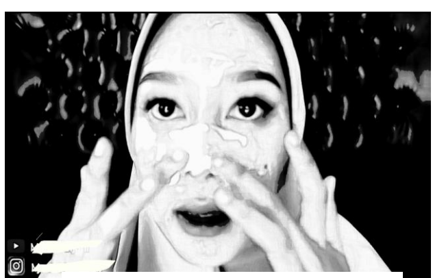
Fig 5. Touch and Face Work