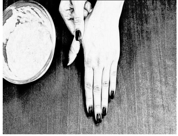
Fig. 8 Touch and hand

and then believing. Her formula the vlogger offers is believed to make the face flawless. Her hands are the proof. The painted nails are meant to be showing something beautiful. The way she touches her hands are more firm, compared to other figures, but this is surely conceiving a confidence, a courage to ask viewers to follow what she has done.