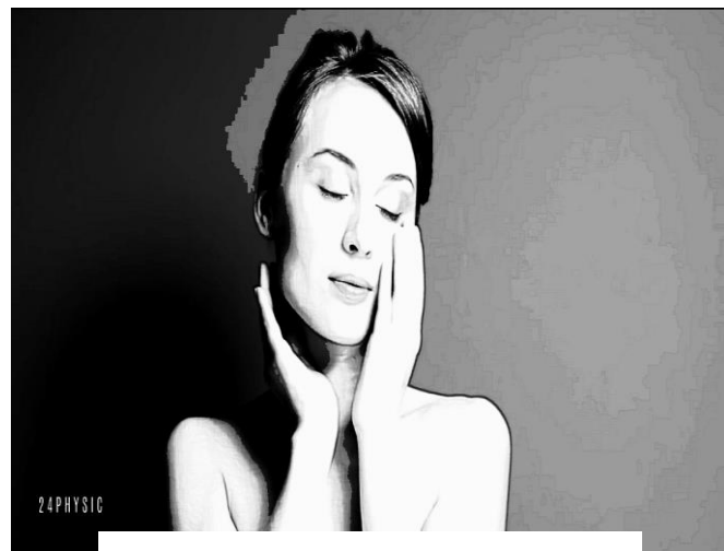
Fig 7. Relaxing Face and Touch