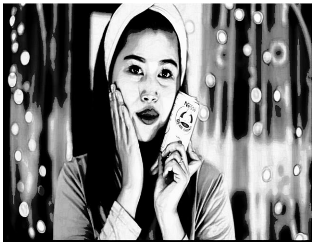
Fig 8. Relaxing Face and Touch

Unlike fig 7, the touch in fig 8 involves the palm of the hands, but still the touch is held in a tender way. Her tender look shows her satisfaction she gets from using the product she is holding right now. She just wants to show it to her viewers her satisfaction.