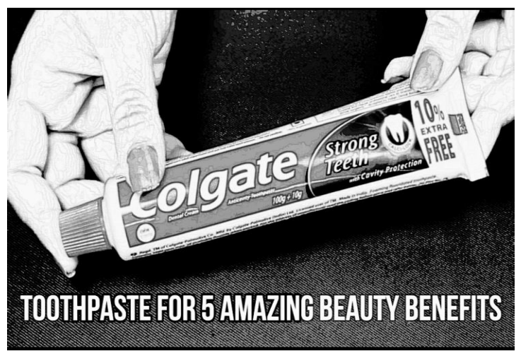
Fig 9. Touch

The following figure shows how women's hands are painted to make them catchy, to give impressions to viewers that these are women's.