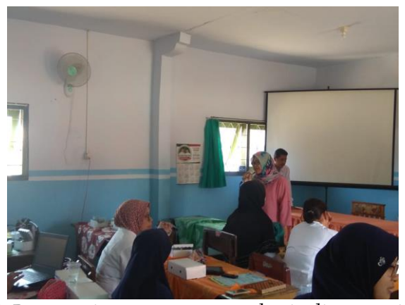
Figure 3. Presentation on awareness value in disaster mitigation

The third and fourth activities were facilitating and evaluating the teachers in the preparation phase of disaster -based learning tools. Assistance and evaluation were