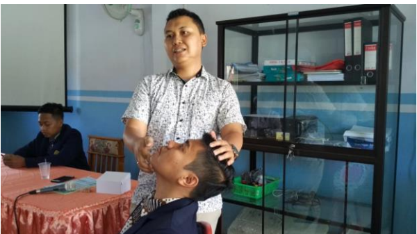
Figure 1. Simulation of first aid procedure for unconsciousness

KKG 03 Silo sub-district in facing disaster issues. This activity took place in two days. Modules 1 and 2 were conducted on the first day and module 3 was conducted on the second day. The outcomes of the activities were the results from the pretest and post-test regarding knowledge about disaster preparedness. The results depicted the effectiveness of the previous training done by the team to the teachers at Pringgondani Elementary School 02. The other outcomes were modules that have been modified to be implemented in the KKG 03 Silo subdistrict which can be handed for other upcoming teachers trainings.