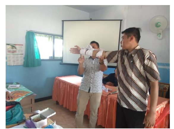
Figure 2. Simulation of first aid procedure for broken bones and fractures