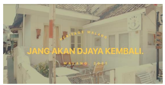
Figure 2. Footage of Promotional Video for the Implementation of Health Protocols "Jang akan Djaya Kembali Heritage Malang"

The show cast of representatives of managers and local communities in the health promotion videos reveals one of the seven principles of health promotion activities proposed by Rootman, namely participatory, involving all stakeholders at all stages of the process. <sup>26</sup> In the initial process of planning, production, and dissemination, the community service team coordinated with and involved representatives of tourism village managers, although it was far from the ideal level of participation by involving all stakeholders in all stages of the education process, production, and dissemination of health promotion messages.