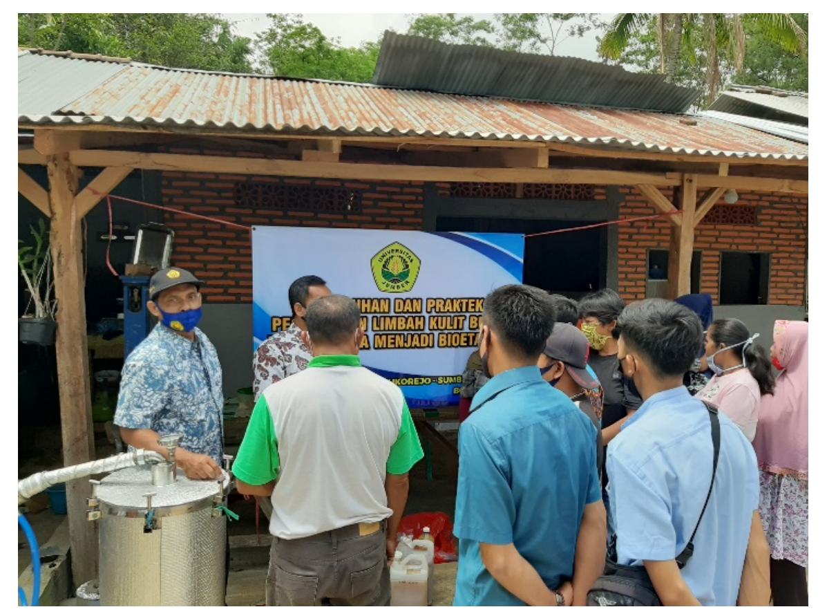
Figure 4. Counseling Activities and Processing Fruit Skin of Coffee Waste to be Bioethanol

From this process, it is hoped that farmers will be able to independently carry out the process of making bioethanol, so that the distillation tool donated to farmers through farmer groups can be used continuously so that coffee fruit skin waste can be used optimally and can reduce the cost of spending fuel in the fruit processing process. coffee until it becomes ground coffee. In addition, it can also reduce environmental pollution caused by waste coffee fruit skins that have accumulated and are not used optimally.<sup>17</sup>