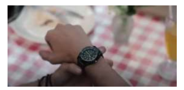
Figure 5: Alarm jam Mika berbunyi - 33:45 (Source: Screenshot Film)

In Figure 4 above, it's shown that Mika affectionately holds Indi's hand, which ultimately led Mika to confess his love. In the dialogue in that scene, Mika says, "Will you be my girlfriend?". Indi, upon hearing these words, can only remain silent while smiling. Moving on to the next scene, which has shifted to a new day, this marks the first time that Mika and Indi are taking their relationship in a more serious direction.