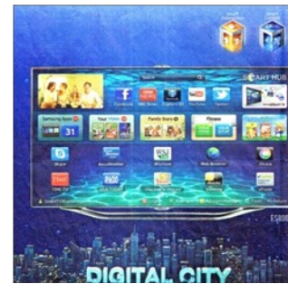
Figure 2 Lead: LoA/Display

multitasking features. This is exactly what Samsung Smart TV offers. Meanwhile, this advertisement uses hue scale, that is blue. Hue is the scale from blue to red (Kress and van Leeuwen, 2006:235). The advertiser fully used blue which indicates calm. This may mean when the customers have the product, they will feel calm/relax watching television. Figure 2 is the Lead of Samsung Smart TV advertisement which consists of LoA and Display.