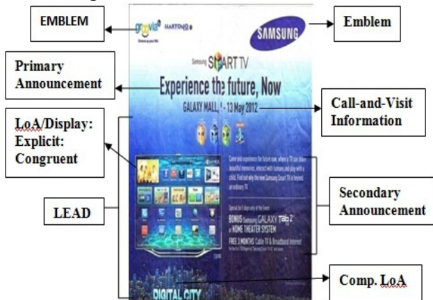
Figure 1 The GSP analysis of Samsung Smart TV advertisement (Source: Jawa Pos, , May 9, 2012)