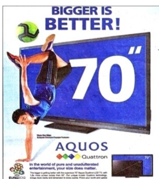
Figure 5 Lead: LoA/Display

According to Cheong (2004), visual elements that are included in the Lead are the Locus of Attention and Complements to the LoA. The Lead as central idea of the advertisement is the most salient element. In SHARP AQUOS Quatron advertisement, the LoA is positioned in the centre of the advertisement. The LoA conveys the central idea that the size of the product is almost as big as the figure shown. It is explained by the existence of the figure that is doing handstand in front of the product. It is as the first Complement to the LoA of the advertisement. Another Comp. LoA is the two televisions positioned in the bottom right corner of the advertisement. Those televisions are different in their sizes. It shows that SHARP AQUOS Quatron is bigger than another one. Those Complements to the LoA corroborate the Primary Announcement. The colours scale used in the advertisement are value and hue scale. The background is coloured light (white), whereas the LoA is coloured blue. It may relate to the brand name, AQUOS, which refers to water and it also means cold. Figure 5 below is the Lead of AQUOS Quatron advertisement which consists of LoA and Display.