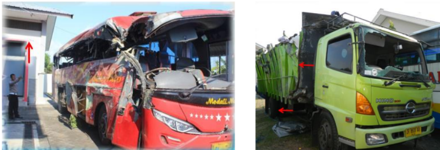
Figure 1. The condition of the buses and trucks involved in the accident

The number of victims was 19 people who came from passengers on Bus N-7130-UA. Ten people died, two people were seriously injured, and seven people were slightly injured. One of the victims who died was a foreign national (WNA) who came from Austria.