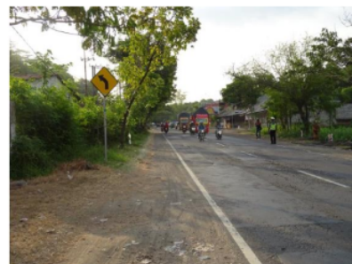
(b) Sign for a left bend from the direction of Situbondo