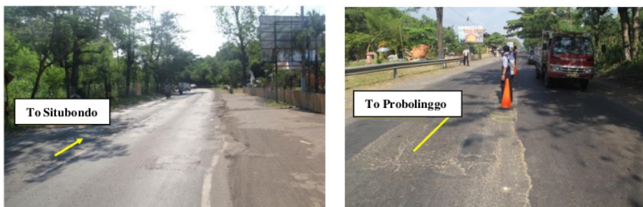
Figure 3. The condition of the pavement at the location of the incident

Jalan Pantura Gending Probolinggo-Situbondo is a national road with type 2 / 2UD (two undivided two-way lanes) and a primary arterial road function. The pavement construction is flexible pavement with a width of 7 meters for two directions with a shoulder of 1 meter on both sides not paved. Based on the National Transportation Safety Committee (NTSC) report, the road surface conditions were in poor condition at the accident. The road surface has many holes, uneven, and patches.