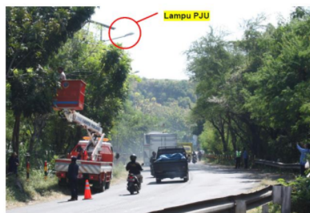
(d) Public Street Lighting at the location