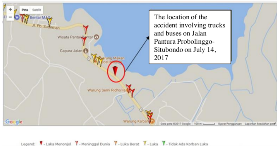
Figure 2. Accident data according to IRSMS at the location of the incident