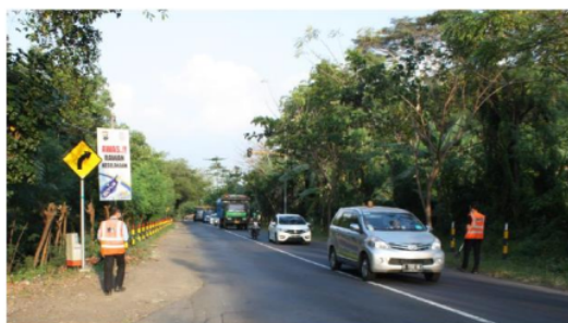
(a) Sign for a right bend from the direction of Probolinggo

Meanwhile, in terms of signage, there is a warning sign for a bend to the right \pm 137 meters before the accident site from Situbondo to Probolinggo (Figure 3). The warning signs are visible. There is a warning sign for a bend to the left \pm 109 meters before the accident location from Probolinggo to Situbondo (Figure 3). The warning signs are visible. There is a warning sign for a bend to the left \pm 50 meters before the accident location from Probolinggo to Situbondo (Figure 3). A thick tree covered the warning sign. There is a middle mark, and the side of the road is white. However, some of the conditions are already blurry. At the location of the accident, the markers were lost due to the overlay process. There are also side markers missing. There is also a warning light about 112 meters before the accident scene from Situbondo to Probolinggo. However, the warning light did not work. This warning light provides a warning in both directions, both vehicles heading to Probolinggo and vehicles heading to Situbondo.