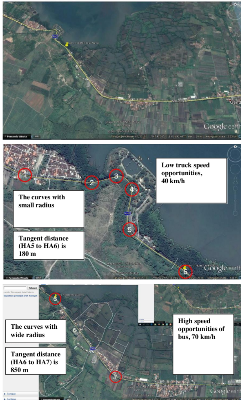
Figure 4. Orientation of the horizontal alignment at the scene

The horizontal alignment conditions at the incident location are several bends with small to large radii and several straight roads. Figure 4 shows the orientation of the horizontal alignment of the scene.