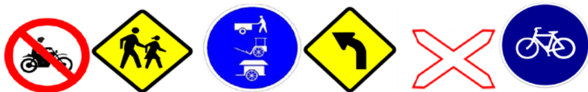
Figure 4. The traffic sign questions

The last part of the instrument on this study were related to the students’ mastery in traffic sign.