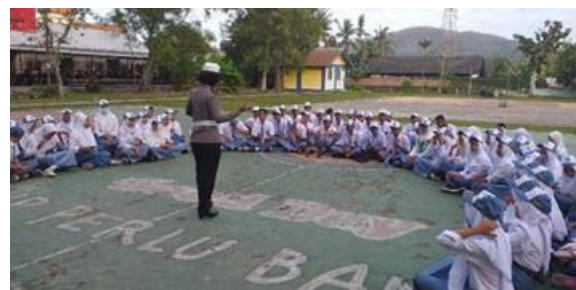
The Representative of Resort Police Lombok Barat Served as Speaker for School's Talk