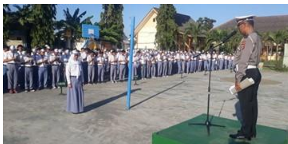
The Representative of Resort Police Mataram Served as Supervisor for Flag Ceremony

In each program, usually there are 3 to 4 police officers involved. The activity usually be conducted in the school's hall, classroom or field yard with total participant around 100 students for each event. The socialization took form of lecturing, sharing or talk show and discussion that generally conducted for 2 to 2.5 hours. To support the students in understanding the content better, the police officer usually prepared the materials in presentation slides. The topics chosen were mostly about the Traffic Law, Traffic Rules, Traffic Signs and the important of lane discipline. The example of the program can be observed in the following Figure 1.