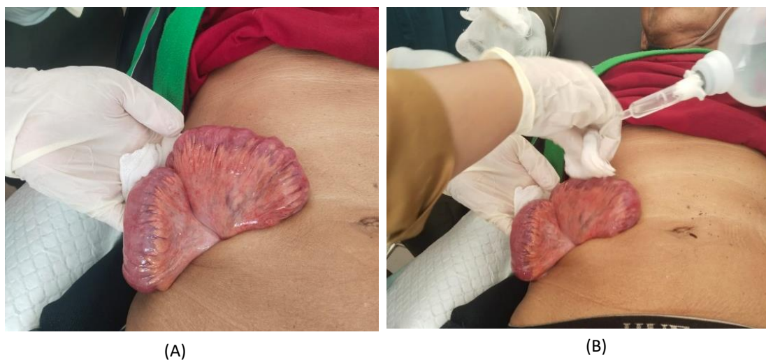
Figure 1. (A) The condition of the stab wound when he first came to the health center, there was visible evisceration of the wound, and (B) The eviscerated intestine is moistened periodically with normal saline and wet gauze

When the patient arrived at the hospital emergency room, the patient's vital signs were BP 80/60 mmHg, pulse 105x/min, RR 28x/min, SpO2 95%, cold acral, visible wounds in the lower right abdominal area accompanied by intestinal evisceration in the wound area. The patient is known to regularly take medication from a cardiologist, including bisoprolol 1x12.5 mg, spironolactone 1x25mg, and atorvastatin 1x25mg, because the patient has a history of chronic heart failure. The patient works as a palm harvester which is related to the stab wounds that occurred. The treatment given when in the emergency room was oxygenation with nasal cannula 4 lpm, administration of 1000ml of Ringer's lactate using two intravenous lines, 1 gram ceftriaxone injection, 40mg omeprazole injection, 30mg ketorolac injection, and insertion of an NGT. Laboratory examination results: WBC 17.33x10 3 /ul, HB 9.4 g/dl, RBC 3.11x10 6 , HCT 27.5%, Urea 76mg/dl, Creatine 1.2mg/dl. An ECG examination performed on the patient resulted in normal sinus rhythm. The patient was planned to immediately undergo an exploratory laparotomy by the surgeon.