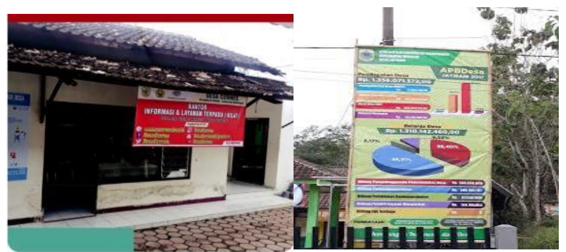
Figure 3 Integrated village service information office of mirrors and posters of the use of village funds

Furthermore, Mr Sutrisno explained that although UMD activities have ended the data validation team continues to conduct surveys to accommodate all the villagers in the village. In addition, the implementation of the SAID community's trust on the performance of village government increased because the village open access to information widely. Through the official website of the village www.cermee.desa.id citizens can advocate criticism, suggestions and feedback and ask for information to the village site operators. One way to increase public confidence in village government is to publicly publish sources and use of village budgets in a form of infographic and published in various forms such as billboards and posters.