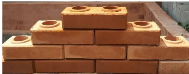
Figure 1. Interlock Bricks

Interlocking bricks, as shown in Figure 1 , are wall components designed with hooks on the sides to withstand compressive forces. These bricks feature puzzle-like locks on specific sides that interlock with adjacent bricks, eliminating the need for additional cement during installation. This characteristic offers advantages over traditional bricks by simplifying the installation process. Research by [7] emphasizes that interlocking bricks do not require post-treatments like plastering and painting, as the interlock system between bricks obviates the need for cement as an adhesive.