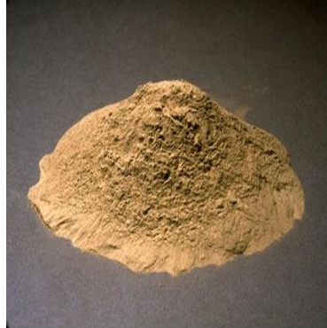
Figure 2. Fly Ash

(Na 2 O and K 2 O), Sulfur Trioxide (SO 3 ), Phosphorus Oxide (P 2 O 5 ) and Carbon. The following are the properties of fly ash: