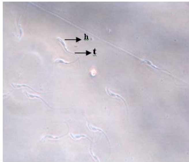
Figure 1. Sperm morphology of plantain squirrel ( Callosciurus notatus ) without staining. h= sperm head; t = sperm tail

staining, semen handling, microscope quality, and personal skills (Esteso et al., 2006; Hidalgo et al., 2006; Rijsselaere et al., 2004)