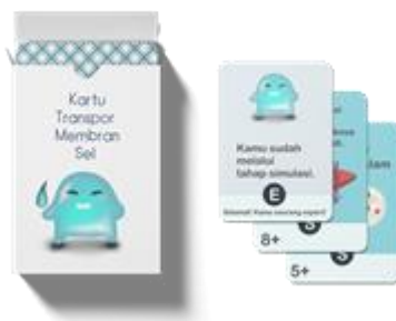
Figure 1. Cards

The results of the board game design are as shown in the following image;