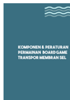
Figure 4. Guide Book