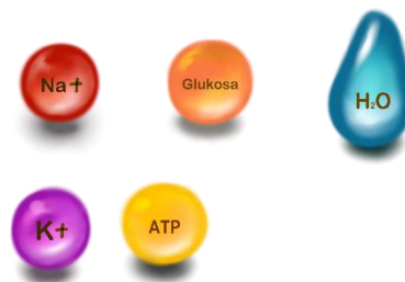
Figure 3. Molecules