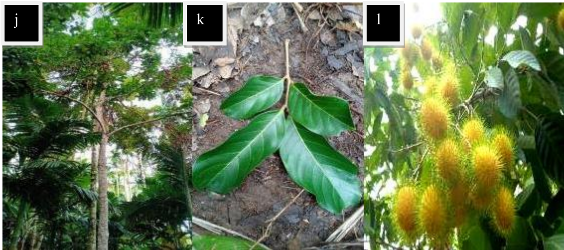
Figure 1: a. Garuda Rambutan Tree, b. Garuda Rambutan Leaves, c. Garuda Rambutan Fruit, d. Lebak Bulus Rambutan Tree, e. Rambutan Leaves Lebak Bulus, f. Rambutan Fruit Lebak Bulus. g. Tai Kucing Rambutan Tree, p. Tai Kucing Rambutan Leaves, i. Tai Kucing Rambutan Fruit, j. Gading Rambutan Tree, k. Gading Rambutan Leaves, and l. Gading Rambutan Fruit.

Based on observations of the morphological characters of the stems, leaves and fruit of cultivated and wild rambutan plants in the form of stems, it will be seen in round, ovoid and imperfectly round tree types, the leaves will be seen in the type of leaf density of cultivated plants which has intense density whereas The wild leaves have a very significant distance between the leaves, and the fruit in cultivated plants has a sweet taste, while the wild rambutan has a sour taste. The flesh of the fruit also has very detailed differences in