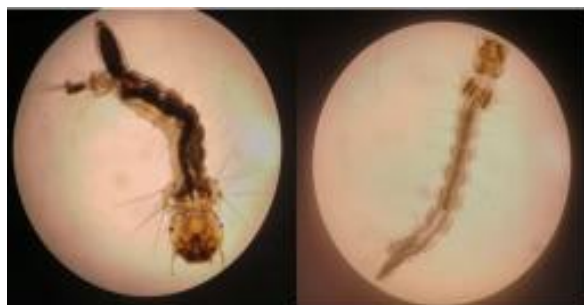
Picture. 3 Differences in Aedes aegypti L. mosquito larvae before being treated with srikaya seed extract ( Annona squamosa L.) (A) and after being treated with srikaya seed extract granules ( Annona squamosa L.) (B) with a concentration of 30 ppm in 24 hours with a 100x magnification.

healthy larvae, post-treatment larvae experienced spinal loss (thorns), and the body became pale, more transparent, and lysis (broken). The body elongated and swelled from the usual size, and became weak in the water.