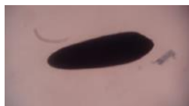
Picture. 1 Aedes aegypti L. Mosquito Egg, with a magnification of 74x.

The picture below is the eggs of Aedes aegypti L. The shape and color of eggs that are ready to hatch are oval and black eggs.