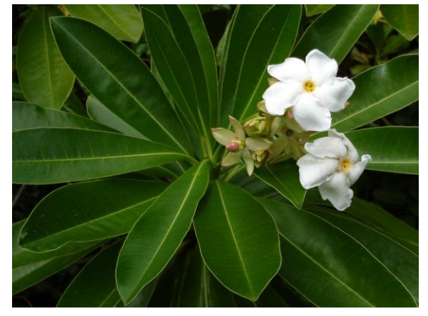
Figure 1. Cerberra odollam Gaertn.

Biofilm from Staphylococcus aureus seen in chronicle infection cases as ulcer on diabetics foot, venous statis ulcer and pressure sores . Patients with infection wound with chronicle ulcer in vein feet found positive culture of Staphylococcus aureus as much as 88-93,3% from a number of infection found.