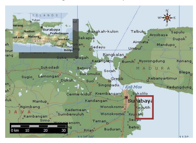
Figure 2. Map of the sampling site of mangrove R . mucronata in Pamurbaya

Samples of mangrove's bark, R. mucronata were obtained in Pamurbaya, Surabaya, East Java. Samples were then dried at room temperature and ground into powder. The total sample that has been obtained was 3 kg of R. mocronata powder.