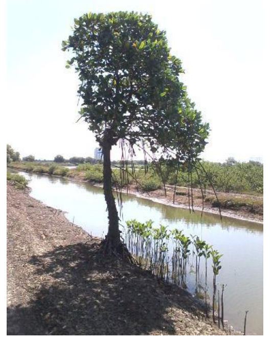
Figure 1. Mangrove Rhizophora mucronata

One of mangroves found in Surabaya East Coastal (Pamurbaya), East Java, Indonesia is the mangrove Rhizophora mucronata . This mangrove species is indigenous mangroves that ethno-botanically popular used as a pain reliever and dyes natural wood. Secondary metabolites contained in the leaves, bark, stems, roots, and fruit are different in quantity. The content of secondary metabolites in plant commonly used as a medicine is from general part of the bark. Therefore, on the basis of chemotaxonomic and ethno-botany of mangroves R. mucronata , this study aims to explore the bioactivity of antioxidant from the stem bark of R. mucronata .