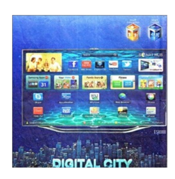
Figure 2 Lead: LoA/Display

multitasking features. This is exactly what Samsung Smart TV offers. Meanwhile, this advertisement uses hue scale, that is blue. Hue is the scale from blue to red (Kress and van Leeuwen, 2006:235). The advertiser fully used blue which indicates calm. This may mean when the customers have the product, they will feel calm/relax watching television. Figure 2 is the Lead of Samsung Smart TV advertisement which consists of LoA and Display.