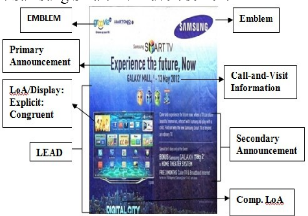
Figure 1 The GSP analysis of Samsung Smart TV advertisement