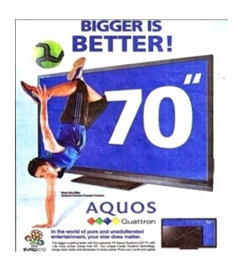
Figure 5 Lead: LoA/Display

According to Cheong (2004), visual elements that are included in the Lead are the Locus of Attention and Complements to the LoA. The Lead as central idea of the advertisement is the most salient element. In SHARP AQUOS Quatron advertisement, the LoA is positioned in the centre of the advertisement. The LoA conveys the central idea that the size of the product is almost as big as the figure shown. It is explained by the existence of the figure that is doing handstand in front of the product. It is as the first Complement to the LoA of the advertisement. Another Comp. LoA is the two televisions positioned in the bottom right corner of the advertisement. Those televisions are different in their sizes. It shows that SHARP AOUOS Quatron is bigger than another one. Those Complements to the LoA corroborate the Primary Announcement. The colours scale used in the advertisement are value and hue scale. The background is coloured light (white), whereas the LoA is coloured blue. It may relate to the brand name, AQUOS, which refers to water and it also means cold. Figure 5 below is the Lead of AQUOS Quatron advertisement which consists of LoA and Display.